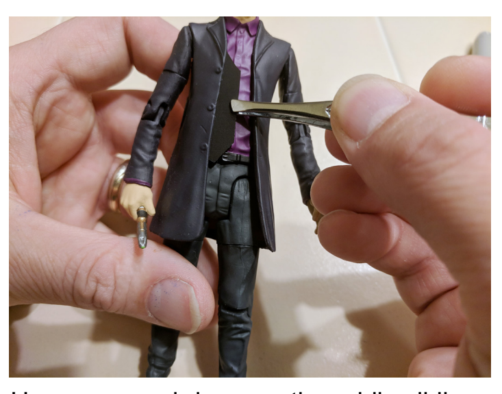
Use an up-and-down motion while sliding the piece in so it doesn't stick before it's in place. It may stick anyway but don't worry, just unstick it and try again.

1. Remove each waistcoat sticker from the backing. Using the sharpie, run the outside edge of each piece along the side of the Sharpie tip. Otherwise, the white edge will show.